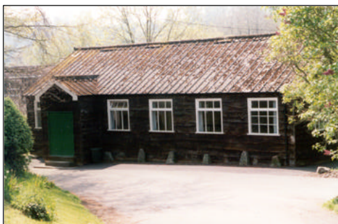
The Village Hall of Swallowcliffe...